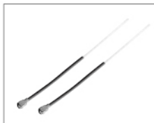
AC2266 2.4G RX ANTENNA, TS6