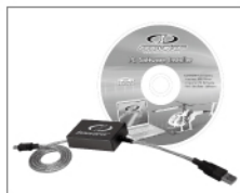
2708 PC SOFTWARE WINTERFACE UNIT