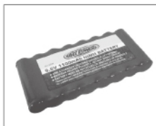
2946-I NI-MH BATT, 9.6V/1.1AH