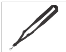
1085 NECK STRAP