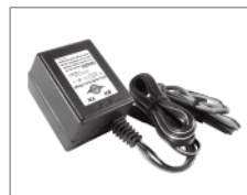
AT2139 TxRx CHARGER, 110V2P/110mA AT2139-J TxRx CHARGER, 100V2P/110mA AT2140 TxRx CHARGER, 230V2P/110mA AT2141 TxRx CHARGER, 230V3P/110mA