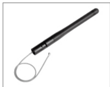
AC2262 2.4G TX ANTENNA, TS6