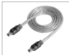
AT0155 COACH CABLE, TS6